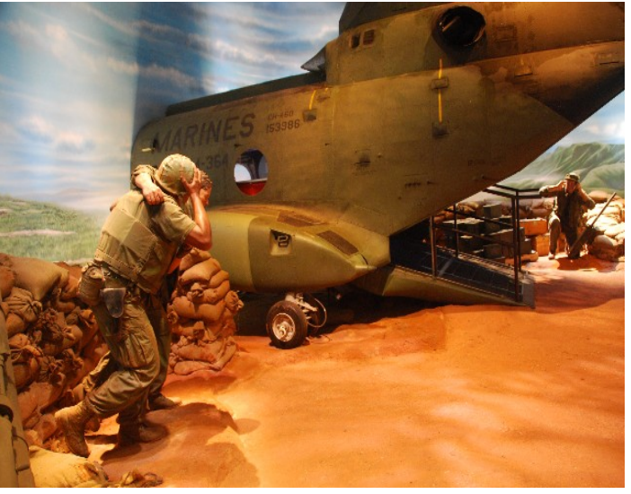
Hill 881 near Khe Sanh. Visitors enter the gallery by walking through the body of an H-46 helicopter of HMM- 364. This photo depicts a Marine leading a wounded buddy to a waiting helicopter to be evacuated from that sun-baked hilltop.