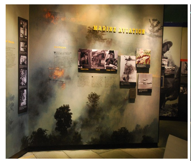
An exhibit depicting the role of Marine Corps aviation during the Vietnam War.