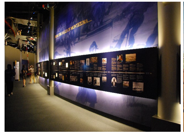
Legacy Walk, a time line contains significant events in American and Marine Corps history from our nation's founding through current times.