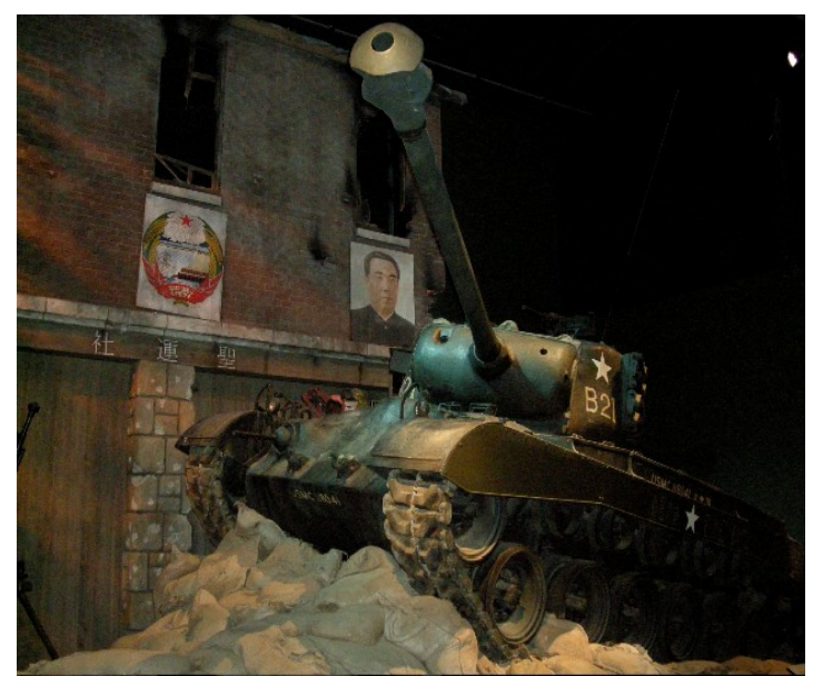
A Marine M 26 Pershing tank maneuvers through the street of Seoul South Korea during the battle to recapture the country's capital city from communist forces.