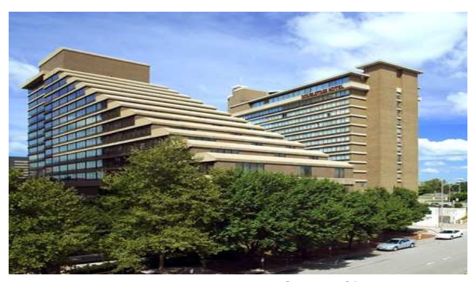
Doubletree Hotel Crystal City

Additions and changes still need to be made let us know if you would like a Friday breakfast.