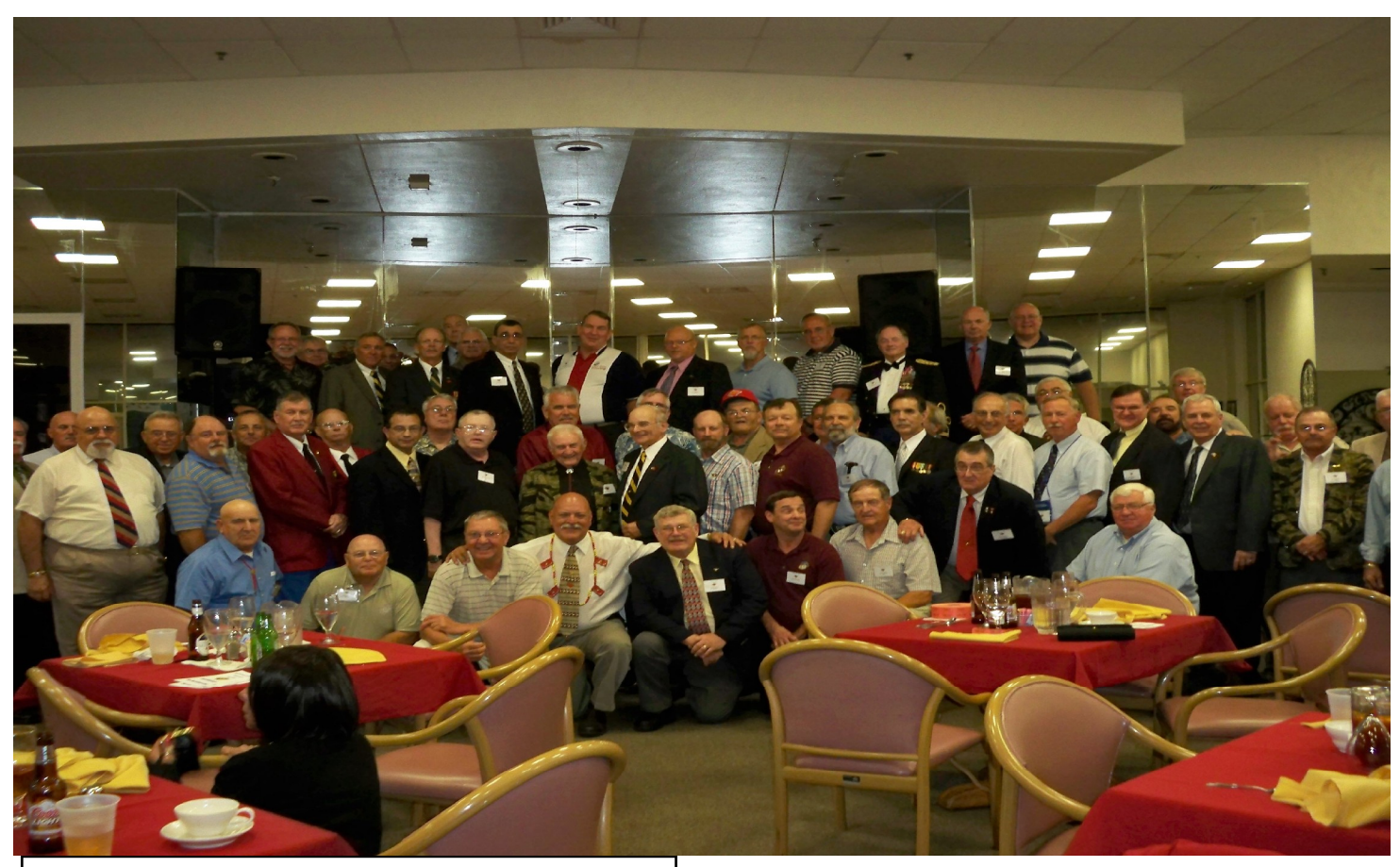
First Marine Aircraft Wing Association – Vietnam Service 567 Rivercrest Drive Woodstock, GA 30188

We are a fraternal organization of Marines and others who were attached to or supported First MAW units serving in the Vietnam War. The organization was founded in 1986 and incorporated as a not-for-profit entity in New York State in 1988. Our purpose is to reunite members of the First MAW either through scheduled reunions or by means of our newsletter, web site, or other various functions. The organization strives to disseminate information about our history as well as about legislation, entitlements, and welfare involving First MAW members.