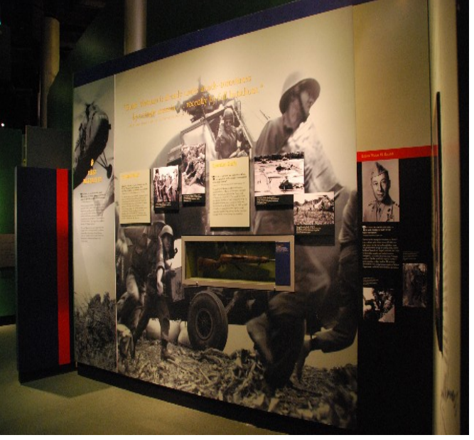
Operation Shufly depicts the first Marine Corps operations in Vietnam from April 1962 through early 1965, when Marine helicopter units provided logistical support for Vietnamese armed forces