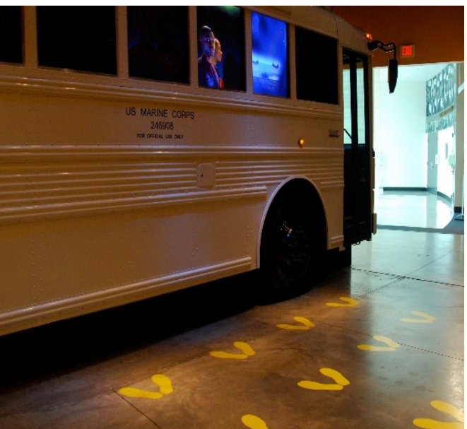
A familiar sight to recruits arriving at Marine Corps boot camp, the yellow footprints they will be lining up on once they have been herded off the bus by welcoming Drill Instructors.