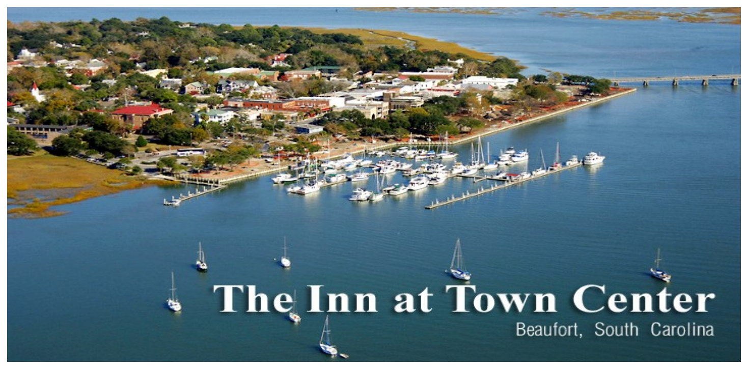
REUNION 2009 SITE

First Marine Aircraft Wing Association – Vietnam Service 567 Rivercrest Drive Woodstock, GA 30188