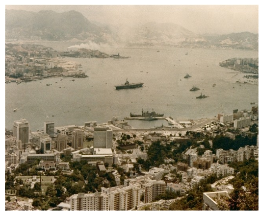
Hong Kong Harbor from atop Victoria Peak looking toward Kowloon and the China Mainland.