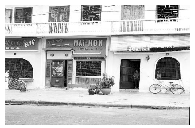
Some of Da Nang's popular bars, just a few blocks from the Grand Hotel. Note the fancy grillwork over windows and doors to deflect VC grenade attacks