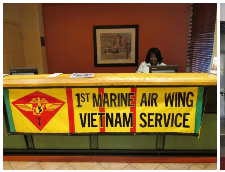
Arriving in New Orleans