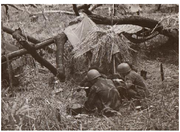
ARVN soldiers grab a quick meal at the temporary campsite on the mountaintop being cleared by Marines. In the background can be seen the poncho shelters where some slept while others guarded the site until the outpost could be completed.