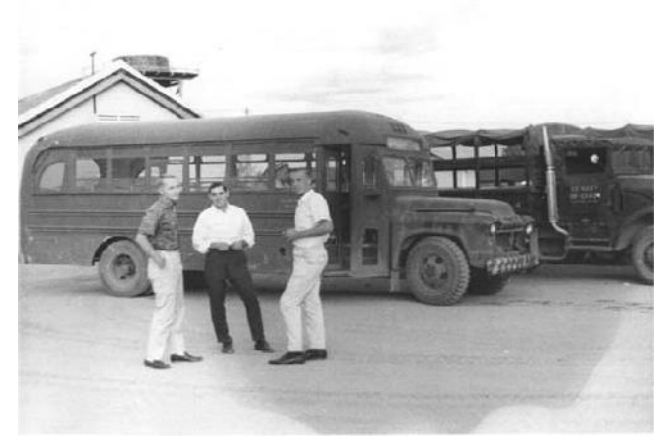
SHUFLY Marines wait for a ride to downtown Da Nang for liberty on the battered old school bus.