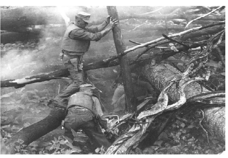
HMM-261 Staff NCOs use a chainsaw to cut a tree during their 6 hour mission.