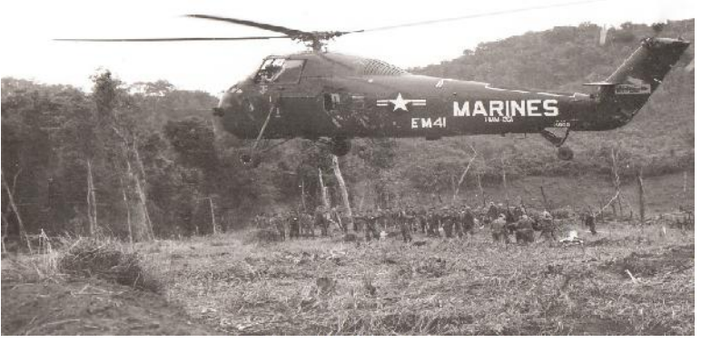
One of HMM-261's helicopters lands in the dangerously small LZ Marines were working to expand.