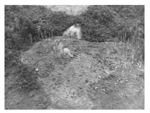
An aerial view of the mountaintop where Marine staff NCOs spent the day clearing trees for an ARVN outpost and landing zone. Upon a close inspection of the photo, a number of large previously felled trees, and ARVN tents and poncho shelters can clearly be seen. The two small circles in the lower left portion of the photo are gun emplacements with 105 mm howitzers.