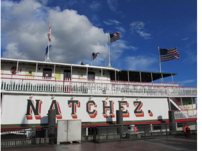
The Paddle wheeler for a ride on the Mississippi