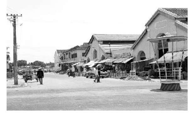
Street scene of Da Nang's market area. Note the scarcity of motor vehicle traffic

The Grand Hotel, drop off point for the SHU-FLY liberty bus, where Marines could have a beer, something to eat or head for one of Da Nang's other entertainment attractions.