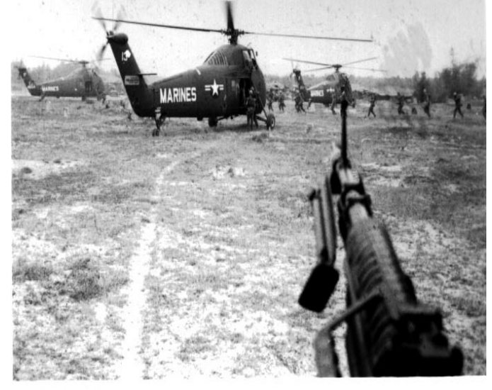
Troop Lift Photo complements of POPASMOKE taken by M/Sgt Shiro Fukunaga