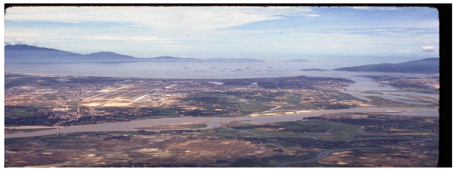
Photo of DaNang Airbase