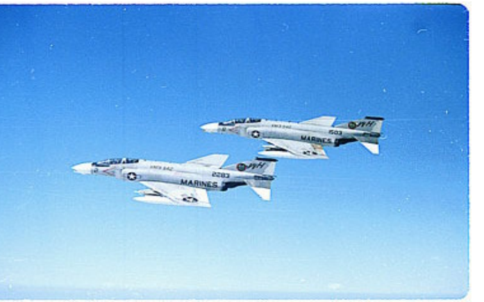
Vietnam. Two F-4b phantoms of VMFA-542, Marine Aircraft Group-11, 1st Marine Aircraft Wing, DaNang RVN, on their way to targets in support of Marines working in Northern I Corps. 01/1969

Vietnam. Medical Evacuation. Marines of Company E, 2nd Battalion, 9th Marines, while under heavy firefight with NVAs within the DMZ on Operation Hickory III, are carrying one of their fellow Marines to the H-34. 07/29/1967