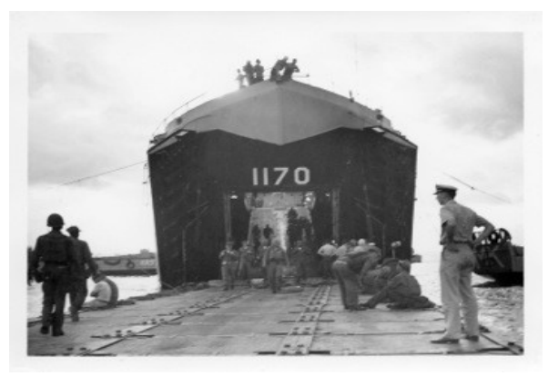
MAG-16 Marines from MCAF Futema disembark from the <u>USS Windham County</u> on a causeway in Taiwan on their way to set up a helicopter airbase