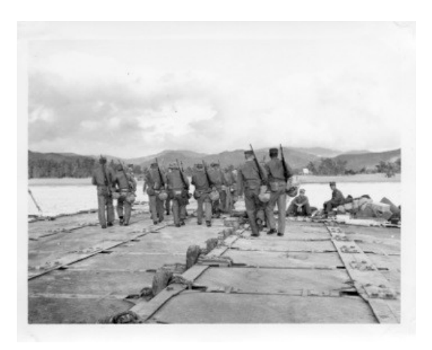
Once the last vehicles disembarked from the LST the remaining Marines followed down the ramp and headed for shore on the pontoon causeway.