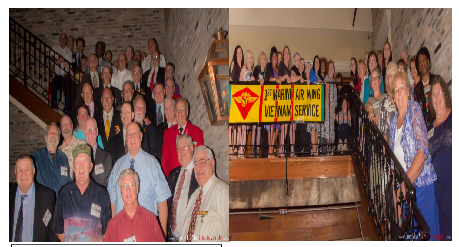
First Marine Aircraft Wing Association – Vietnam Service 603 63<sup>rd</sup> Ave W. Lot A-10, Bradenton, FL 34207

We are a fraternal organization of Marines and others who were attached to or supported First MAW units serving in the Vietnam War. The organization was founded in 1986 and incorporated as a not-for-profit entity in New York State in 1988. Our purpose is to reunite members of the First MAW either through scheduled reunions or by means of our newsletter, web site, or other various functions. The organization strives to disseminate information about our history as well as about legislation, entitlements, and welfare involving First MAW members.