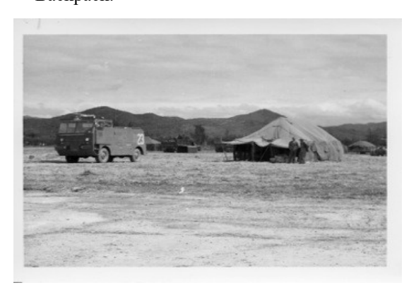
The MABS-16 crash crew operations tent and airfield fire truck stand by to respond to any emergency