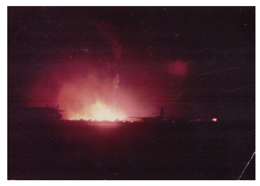
Rocket Explosion at VMGR 152 sub Unit #1 DaNang