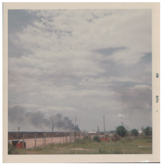
Da Nang August 22 , 1968 Huey's Rocket Attack