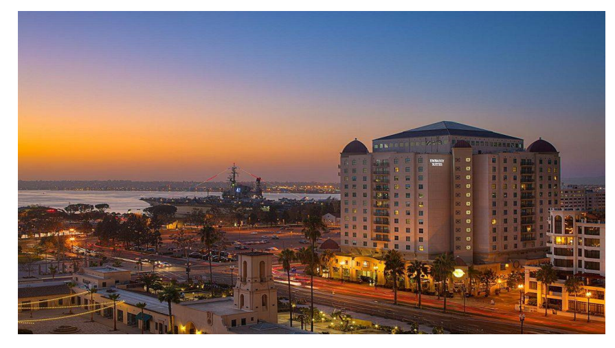
Reunion 2017 San Diego Embassy Suites Sept 14-17