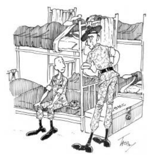
"You're not a square peg in a round hole, you're a recruit."