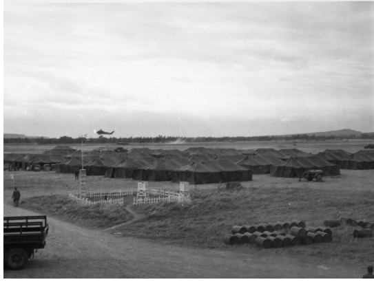
The tent city built by MABS-16 Marines at the old auxiliary Chinese airfield was home for the MAG-16 Marines who participated in Operation Backpack.