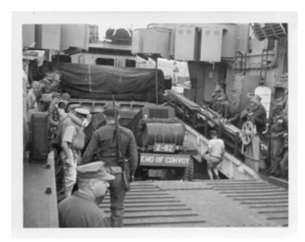
The last vehicle drives down the LST ramp to the floating causeway connecting the ship to the landing beach