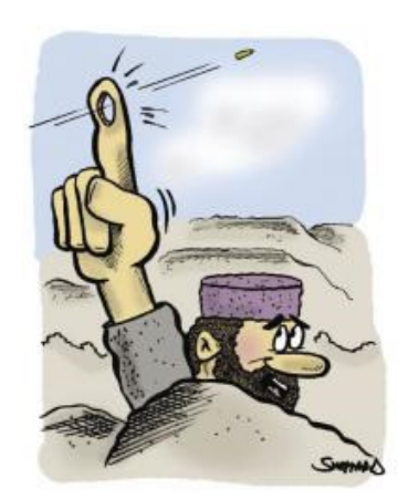
"I know, I know. We should not check wind direction with Marine snipers in the area!"