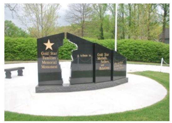
The front side of each monument has a Gold Star affixed to it, under which the words "Gold Star Families" are inscribed beside the hollow silhouette of an armed forces member saluting. The other panels are inscribed with the following words, "A tribute to Mothers and Fathers and Gold Star Families who sacrificed a Loved One for our Freedom."