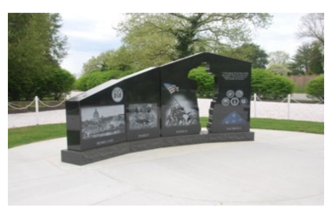
The other side of the monument incorporates images depicting the Foundation's Core Values of Homeland, Family, Sacrifice and Patriotism. The Annapolis monument features a view of the U.S. Naval Academy, a military family, the Iwo Jima flag raising and the official seal of each military service and a folded American flag.