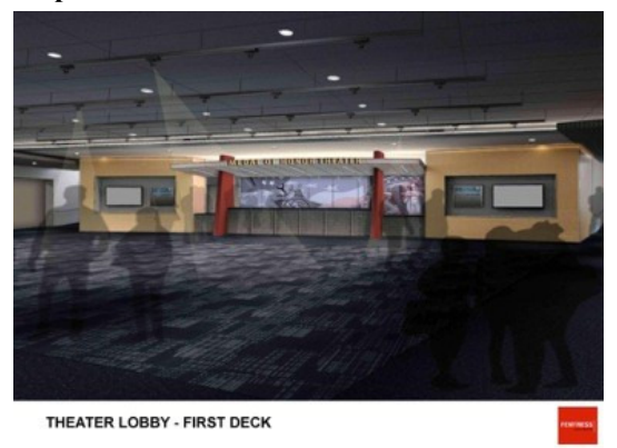
Interior of the Medal of Honor Theater scheduled to open at the NMMC this summer.