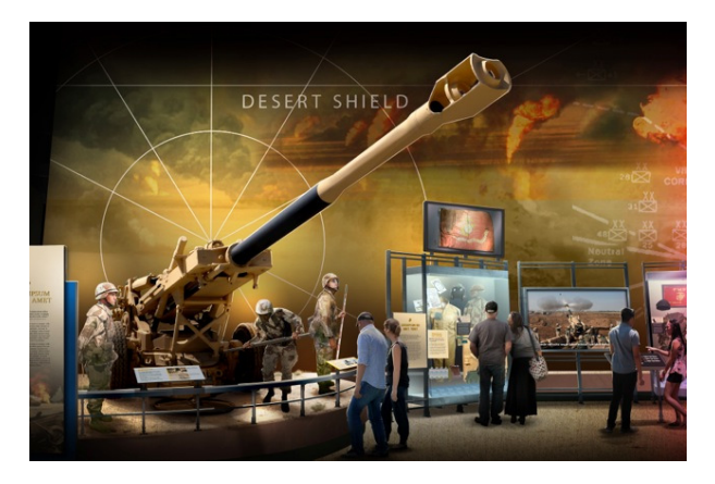
Artist renderings of new visitor exhibits depicting Marine Corps deployments between 1976 and the present planned to open in 2018.