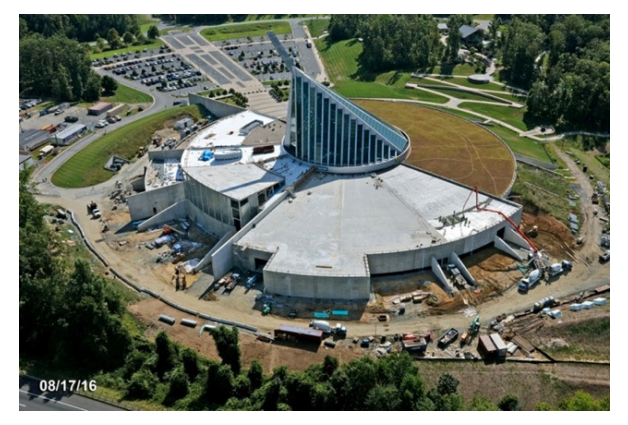
Aerial photo of the NMMC taken late last summer after the new construction was fully undercover. The tall protrusion on the left side of the photo accommodates the large screen for the Medal of Honor Theater.