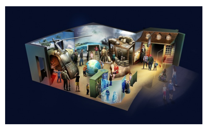
An artist rendering of an expanded education suite and Children's Gallery that will open this summer.