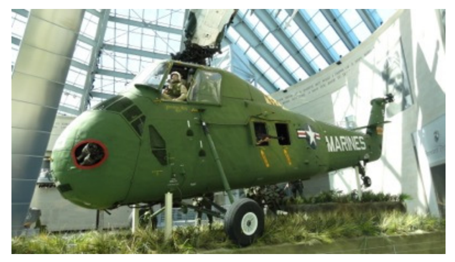
Port side view YN-19 that has just disembarked Marines in the landing zone, as the M-60 machine gunner stands ready to provide fire support if needed.

A sign posted at the exhibit explains why the helicopter's main and tail rotors are missing. They could not be installed because of the false wall behind the exhibit, but will be added as soon as that construction work is completed, and wall is removed.