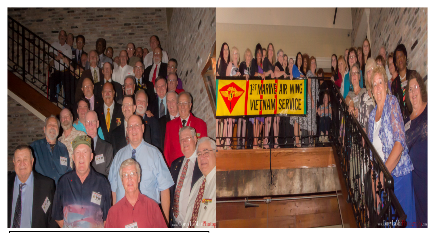
First Marine Aircraft Wing Association – Vietnam Service 5282 Ousterhout Drive Sterling, MI 48659

We are a fraternal organization of Marines and others who were attached to or supported First MAW units serving in the Vietnam War. The organization was founded in 1986 and incorporated as a not-for-profit entity in New York State in 1988. Our purpose is to reunite members of the First MAW either through scheduled reunions or by means of our newsletter, web site, or other various functions. The organization strives to disseminate information about our history as well as about legislation, entitlements, and welfare involving First MAW members.