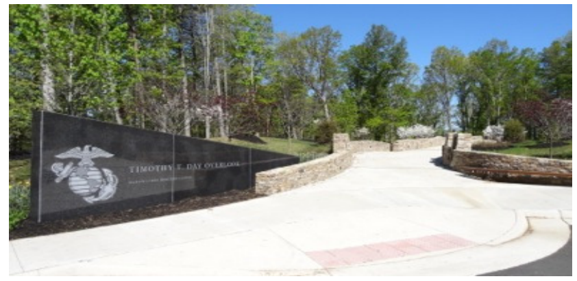
The Timothy T. Day, Overlook in Semper Fidelis Memorial Park, adjacent to the museum. The overlook gives visitors a scenic vista along the park's memorial lined paths.