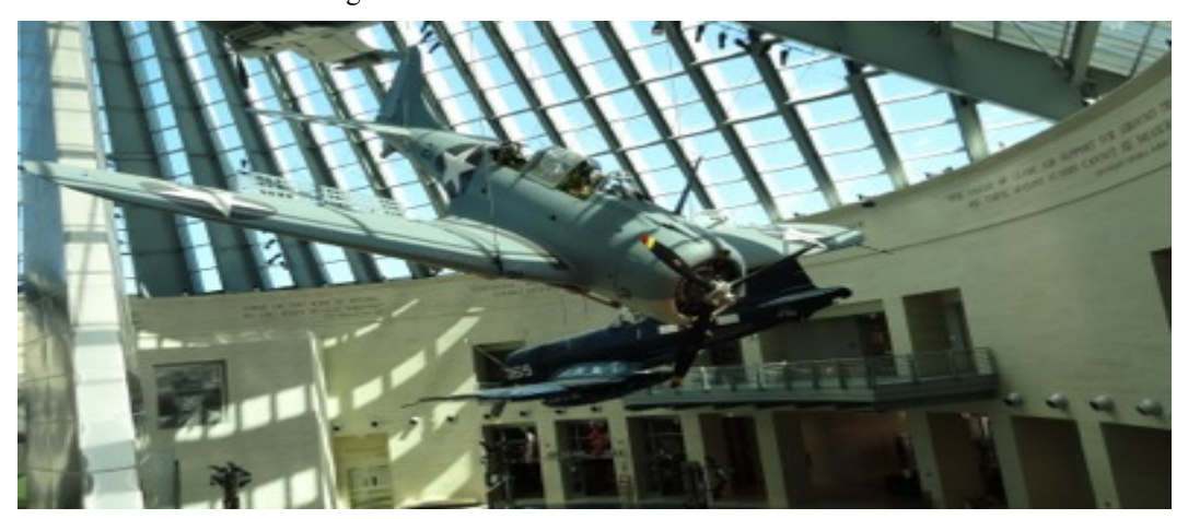
The Dauntless is displayed suspended from the atrium of the NMMC in a simulated bombing run.