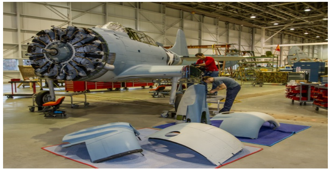
The Douglas SBD-3 dive bomber undergoing the final stages of more than 65,000 hours of restoration needed before being installed in the NMMC.