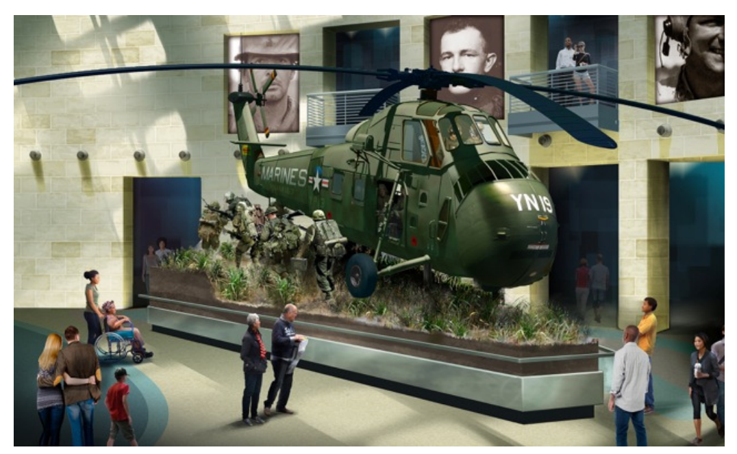
An artist rendering of YN-19, the Sikorsky UH-43 helicopter that flew extensive combat missions in Vietnam, will go on display in Leatherneck Gallery next year.