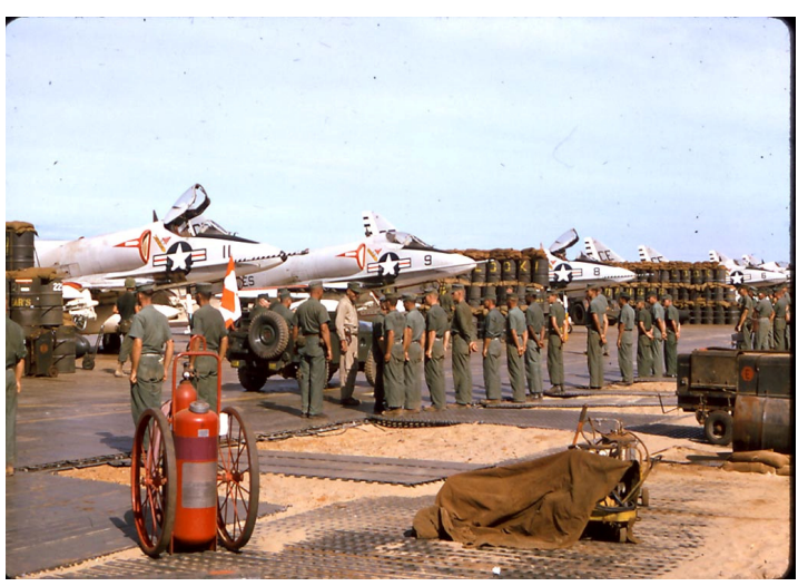
Lt. General Victor Brute Krulak CO FMF PAC Inspects VMA 225 Flight Line at Chu Lai July 1965